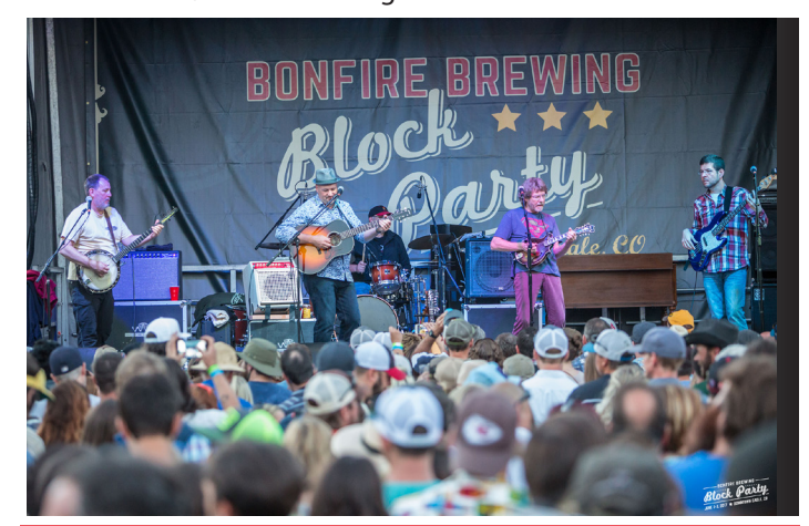
The Bonfire Block Party has grown into a major community event, hosting nationwide acts and attracting between 7,000-10,000 people to town over the course of the weekend.

You can learn more about Bonfire Brewing's story by visiting bonfirebrewing.com, or on Facebook, at facebook.com/bonfirebrewing.